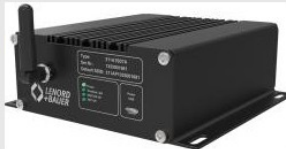
The new GEL 211 mobile testing and programming tool

A new mobile testing and programming unit for the full range of Lenord + Bauer's MiniCODERs can be used remotely using devices such as laptops and tablets on machine tool applications, such as high speed cutting (HSS) without the need to open the spindle. It can be used during installation, commissioning and servicing, as well as for routine maintenance and fault finding. The data derived from the SIN/COS signals, as well as reference signals, can indicate issues such as damage to the tooth-wheel, or run-out potentially caused by bearing wear.