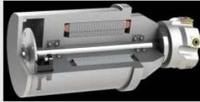
Illustration showing the MiniCODER's toothed wheel attached to the shaft of a high-speed spindle

Lenord + Bauer's MiniCODERs are miniature, precision speed and position sensors that can be incorporated into the smallest of spaces within a machine such as on a rotating shaft, machine tool spindle, cam, or inside a motor or gearbox. They are compact, robust and do not require their own bearings so are completely wear and maintenance free.