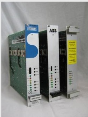
The Seidel 60WKS in various guises. Still supplied and serviced by us nearly 30 years on.

At Motor Technology our philosophy is to provide customers with solutions that suit them rather than trying to sell something that suits us, as is often the case with large manufacturers. We have access to a wide range of products from different suppliers, including second hand and refurbished products. We can even supply legacy products that are essentially discontinued lines manufactured under license.