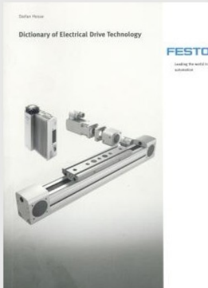
Festo's Dictionary of Drive Technology contains almost 200 pages of technical references.

Further definitions of "Jerk" and "Jerk Limitation" in motion control applications can also be found on Wikipedia .