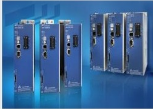
The new ARS2000-SE range with Ethernet and USB connectivity, Safe-torque-off and four times peak current.

Our German supplier, Metronix, has launched a new range of drives that cuts costs to customers, typically by up to 20%. Metronix have achieved this by cutting out features that are not needed in a lot of applications. Despite this the new ARS 2000-SE range retains all the high performance benefits of the existing ARS 2000 series and even adds a few.